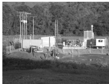
Delaware County Waste-to-Energy Project

DCEC continues to work on projects to ensure that the future needs of our members are met. One project is nearing completion with the other in early development.