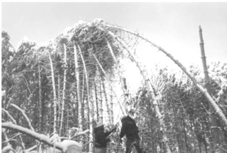
Trees bent under the weight of heavy snow

Very early in the morning on October 28 th , heavy snow began falling throughout the DCEC service territory. By 5:00 am, DCEC dispatchers began to receive a flood of calls from members reporting wide-spread power