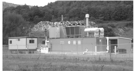
Delaware County Waste-to-Energy Project

RECs are marketable commodities that are purchased by businesses, municipalities and other large consumers to demonstrate commitment to renewable resources. Under the terms of the sale, ECA purchased 100% of the 2010 RECs generated from the facility.