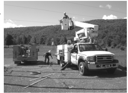
DCEC line crew at work

On April 26, the DCEC Board of Directors announced plans for an increase in electric rates effective July 2011 due to rising operational costs. The total increase will result in a 7.9% increase in revenues to DCEC over a 2-year period of time. A 4.1% increase will be implemented in July 2011 and a tentative 3.8% increase in July 2012. The most significant cost increases necessitating this action include: