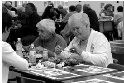
DCEC members enjoying their chicken BBQ at the 2009 Annual Meeting

The Delaware County Electric Cooperative will hold its Annual Meeting on Friday, September 10th at the Delaware Academy & Central School in Delhi. As always, the meeting gives members a chance to gather for a barbecue chicken dinner, hear reports on the activities of the co-op over the past year and learn about plans for the future. Members will also vote on matters of DCEC business including the election of three members of the board of directors (see page 2 for more details).